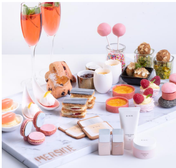
「Stone Blossom」 Afternoon Tea